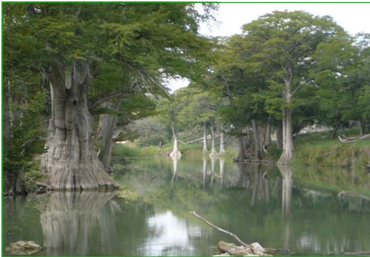
Views like this one at Rebecca's Creek Crossing, make the upper river a great place for a paddling trail.

For more info contact us at: (830) 907-230 Amanda@wordcc.com